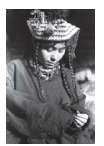
Kalash woman, Pakistan, 1952