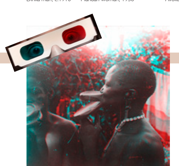
Kaba woman wearing lip plugs, 1908