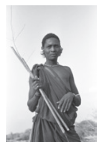
Endo man. Tanzania. 1963