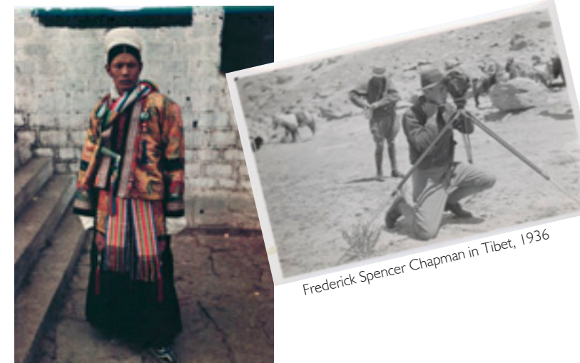
Jigme Taring, 1937 The Potala Palace from Chakpori, 1936