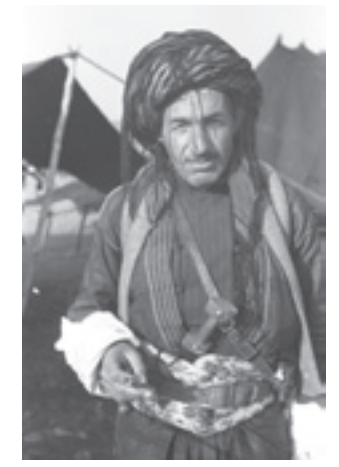
Sharafani man, Iraq, 1951