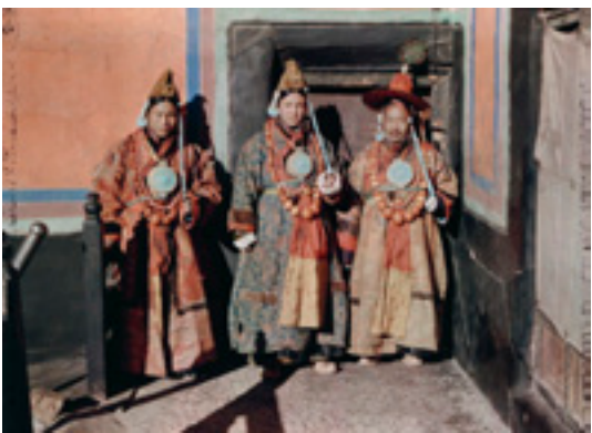
Three men at New Year, 1937