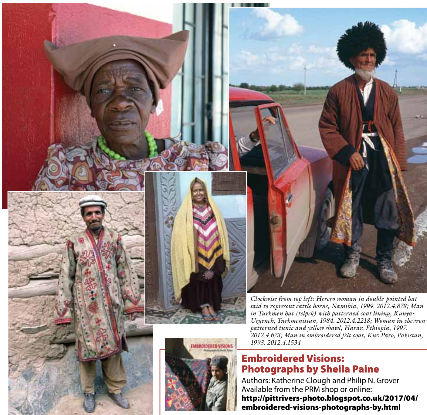
Clockwise from top left: Herero woman in double-pointed hat said to represent cattle horns, Namibia, 1999. 2012.4.878; Man in Turkmen hat (telpek) with patterned coat lining, Kunya-Urgench, Turkmenistan, 1984. 2012.4.2218; Woman in chevron-patterned tunic and yellow shawl, Harar, Ethiopia, 1997. 2012.4.673; Man in embroidered felt coat, Kuz Paro, Pakistan, 1993. 2012.4.1534