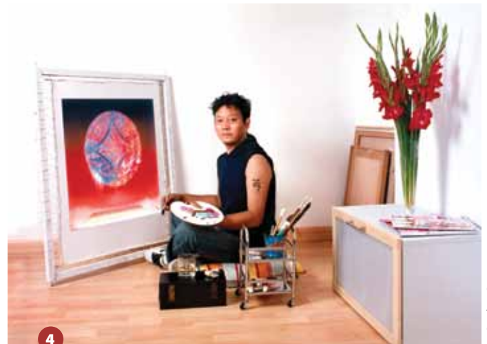
My Identity 1-4 by Gonkar Gyatso, a sequence of four colour prints on the identity of the Tibetan artist in different cultural and political environments. 1. As 'traditional' painter in Tibet; 2. As Tibetan artist in Communist-controlled Tibet; 3. As artist in exile, Dharamsala, India; 4. As Western-based artist

socio-economically challenged groups and audiences for whom the Museum can provide a welcoming space. These include groups involved with autism, partial-sightedness, dementia, and refugees as well as local BAME (Black, Asian and Minority Ethnic) organisations and other grassroots movements. I am proud to say that these plans were drafted collaboratively with our staff who would like the PRM to be a key resource for Oxford and the world.