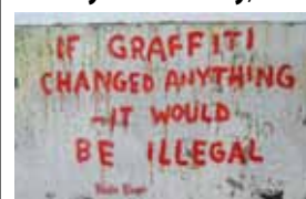
Banksy (and others), Bloomsbury, 2010

Anthropology, Oxford Brookes. In a world where street art is now a career choice for budding artists, what status is left for graffiti? Threatened by urban gentrification strategies and the rise of the Net, can graffiti still pack a political punch?