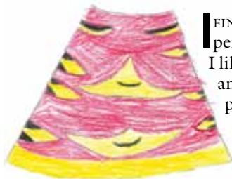
Feather cloak decorated all over with yellow, red and black feathers, Hawaii 1951.10.61

I FIND it fascinating that they could only pick a couple of feathers per bird and make all the different colours and patterns. Also, I like that it is a cape that was worn by kings and powerful men and that they found their backs and necks the most important part of their bodies and the cape protects that part. And that it showed that you were higher status. It must have taken ages to make, because there are so many feathers: hundreds of thousands of them! I find it amazing that it has passed through so many people and it is still in such good condition.