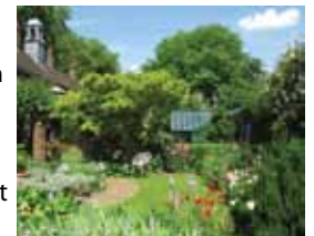
Period gardens in summer

beautiful 18th-century almshouse buildings, amid attractive period gardens. £7 to include curator's talk and guided tour. Reserve your place by 26 May. Contact: dorothywalker6@googlemail.com See flyer