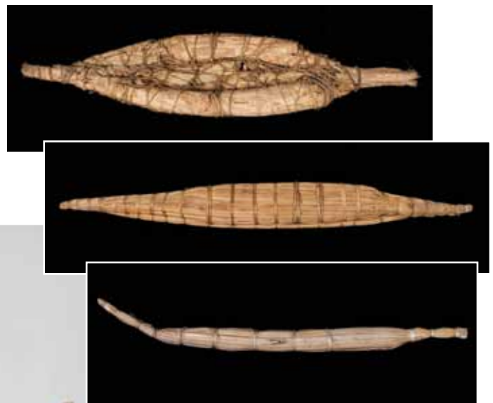
Above top: Model canoe made from bundles of tea tree bark bound with fibre from the Tasmanian hemp bush, PRM 1893.50.13; Centre: Model canoe made of reeds bound together at regular intervals with plant fibre, Tasmania PRM 1893.50.14; Bottom: Model reed canoe designed for the tapered ends of the bow and stern to rise out of the water, PRM 1893.50.15