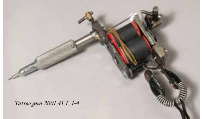
Tattoo gun 2001.41.1 .1-4

We want to see the Museum doing more with its unique resources. Internally, this means strong programming, excellent stewardship of our collections, and ensuring that our staff are enabled to maximise their skills and talents. Externally we want to increase