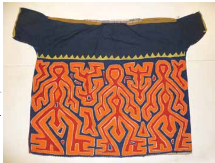
Above: Mola: blouse with blue yoke and sleeves, San Blas Islands, Panama. 1924.46.89; Above right: Beaded arm and leg guards worn by Kuna women; Below right: Albino slaying moon dragon with bow and arrow during lunar eclipse which hangs in the San Blas Museum

The Pitt Rivers owns many examples of mola or textiles made by Kuna women that date back to the 19th century. Their patterns are inspired by body-painting designs and are cut in intricate shapes and contrasting bright colours and then sewn onto cloth in a style