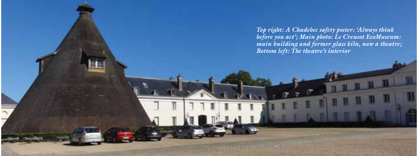
Top right: A Chadebec safety poster: 'Always think before you act'; Main photo: Le Creusot EcoMuseum: main building and former glass kiln, now a theatre; Bottom left: The theatre's interior

LE CREUSOT is a small French town, 35 km west of Chalon-sur-Saône and 20 km south-east of the Morvan National Park – essentially the back of beyond. It first came to prominence in 1786 when Queen Marie Antoinette's crystal glass factory, the Château de la Verrerie (Crystal Palace) was built there; this was bought by its competitors in 1832 and closed down. In 1837, following the discovery of deposits of iron ore nearby (the closest large town is called Monceau-les-Mines), the buildings were bought by the Schneiders, a family of ironmasters who developed the site for the heavy industry characteristic of the age of steam. Today, their company, Schneider Electric, is based in Paris and has an annual turnover of €30 billion; it is around the 200th largest company in the world.